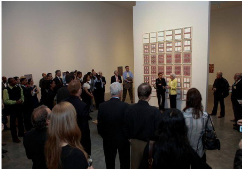
these people are all either hires or dupes

Well, why waste money on finishing the place out and decorating it? The place is just a prop, like a Hollywood set. The gallery opening could be done under an awning or in a cardboard box—it doesn't matter. The only important thing is that some well-dressed people show up who seem to have money. This is apparently enough to fool the regulators.