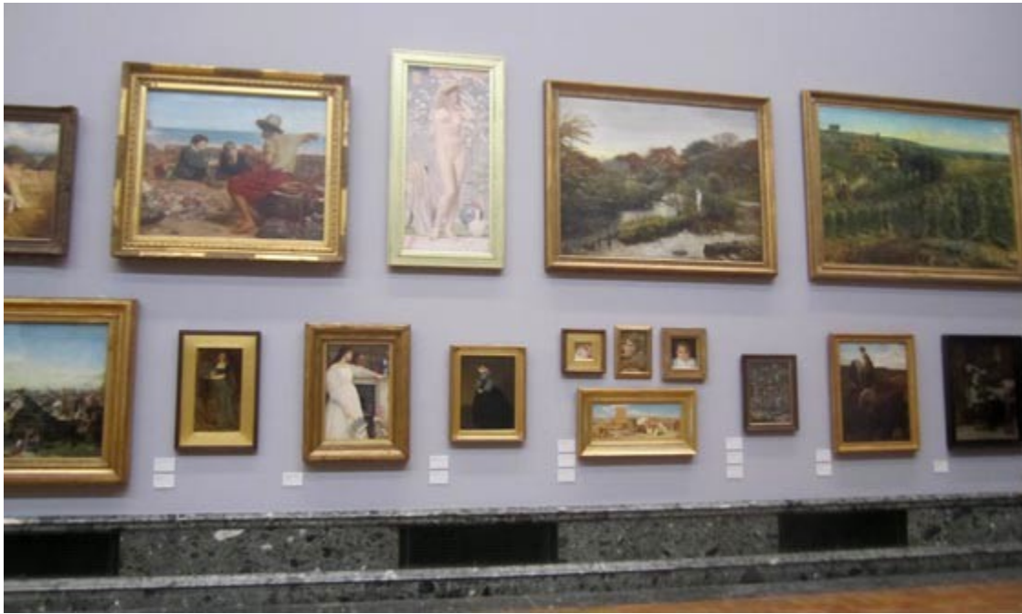
before: Tate Britain 19 th century gallery